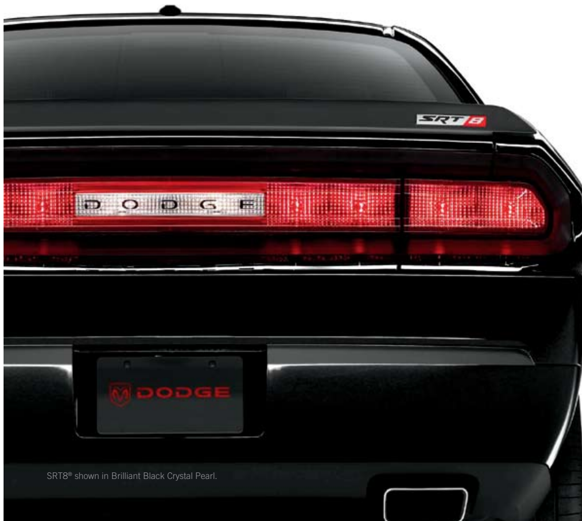
SRT8® shown in Brilliant Black Crystal Pearl.