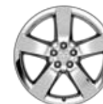
20" Chrome-clad Cast Aluminum Opt. R/T