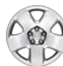
17" Wheel Cover Std. SE