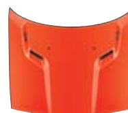
Hemi Orange R/T only

*Limited availability. Since the time of printing, some of the information you'll find in this brochure may have been updated. Specifications and all competitive comparisons are as accurate as known at the time this publication was approved for printing.