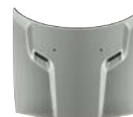
Bright Silver Metallic