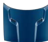
Deep Water Blue