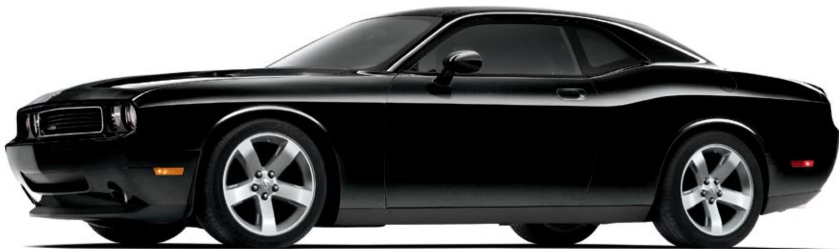
SE shown in Brilliant Black Crystal Pearl with optional 18" cast-aluminum wheels.