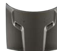
Dark Titanium Metallic