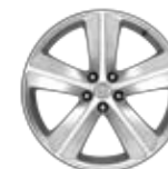
20" SRT® Forged Aluminum Std. on SRT8®