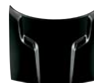
Brilliant Black Crystal Pearl