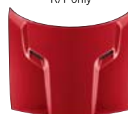
Inferno Red Crystal Pearl